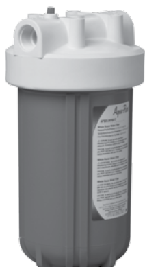
AP801 / AP801-C